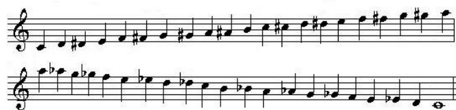
The notes of the Cornell Chimes.