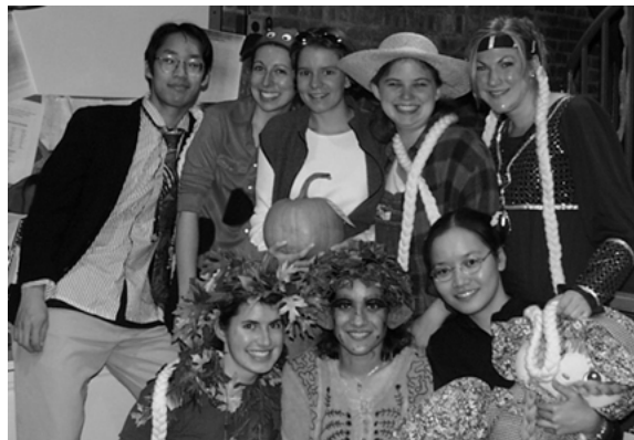
Costumed chimesmasters gather for Halloween fun