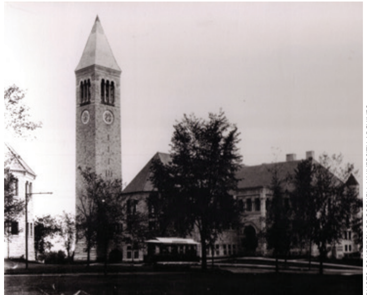
McGraw Tower with trolley.

If you enjoyed this and are yearning for more chimes history (including more recent years), join us for our 150th anniversary celebration in September!