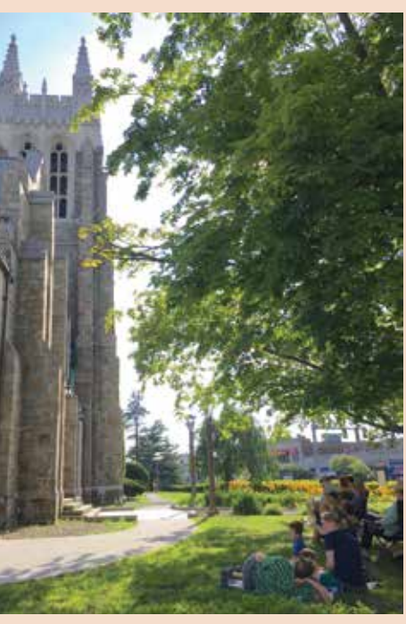
Visitors enjoy a summertime concert on the lawn of the First Unitarian Universalist Society church in Newton, Massachusetts.