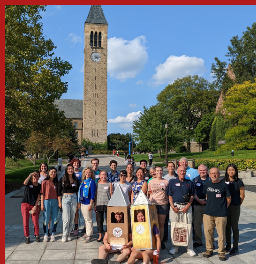
ALUMNI MEMBERS OF THE CHIMES ADVISORY COUNCIL RETURNED TO CAMPUS IN SEPTEMBER

Learn more at chimes.cornell.edu/giving .