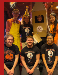
CHIMESMASTERS AT THE HALLOWEEN CONCERT