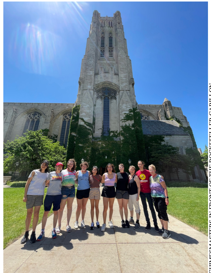
CHIMESMASTERS IN FRONT OF THE ROCKEFELLER CARILLON

This Congress was a wonderful opportunity to introduce our chimesmasters to the bell-ringing community outside of Cornell. The chimesmasters and I are all incredibly grateful to those who made this trip possible through gifts to the Cornell Chimes. The next Congress will be held in Cohasset, MA from June 14-17, 2023. I know we have many chimes alums in the Boston area - we'd love to see some of you there!